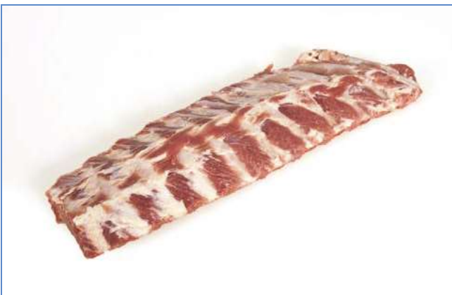
4 Loin Ribs.