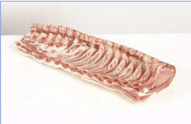
1 Loin of pork.