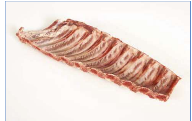
3 The ribs are removed from the loin by sheet boning.