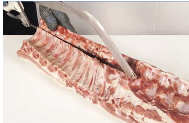
2 The ribs are sawn through at a point where they join the vertebrae.